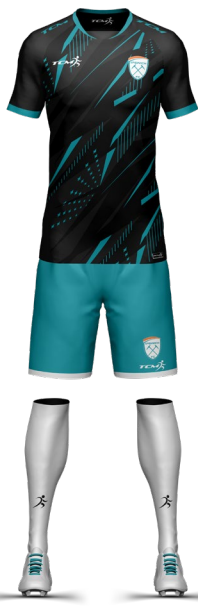
Match Day Kit Juniors