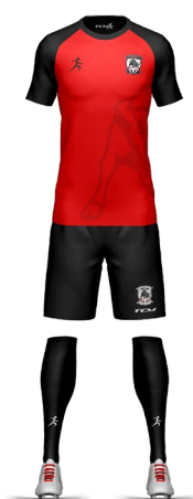
Alternate On Field