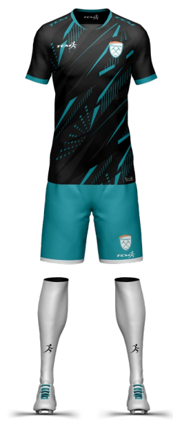
Match Day Kit Juniors