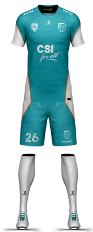
Home On Field