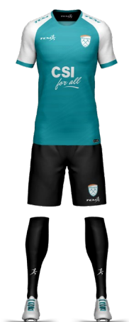
Home On Field