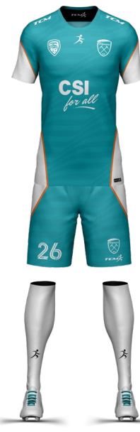
FQPL & FQA Playing Kit No numbers for FQA