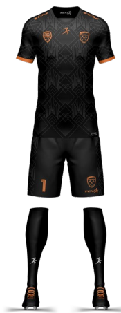
Alternate On Field