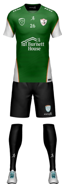
Calves Playing Kit