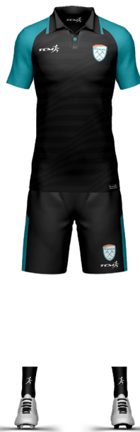
Match Day Kit Youth & Senior