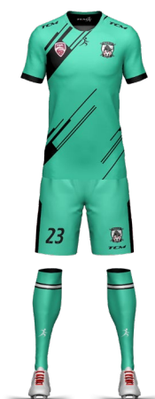
Alternate On Field