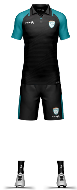
Match Day Kit Youth & Senior