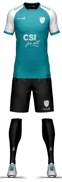
Metro Playing Kit